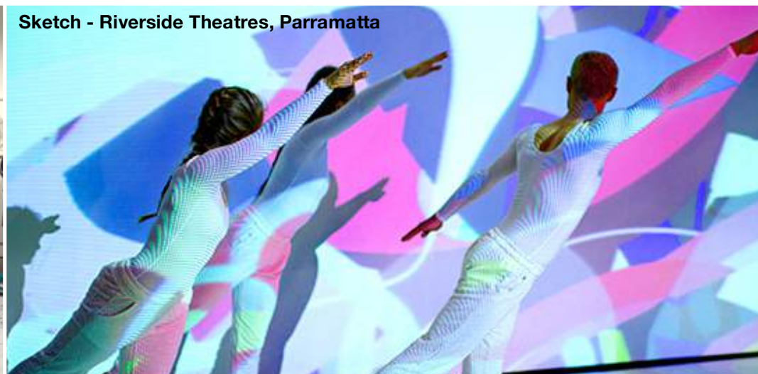
Sketch - Riverside Theatres, Parramatta