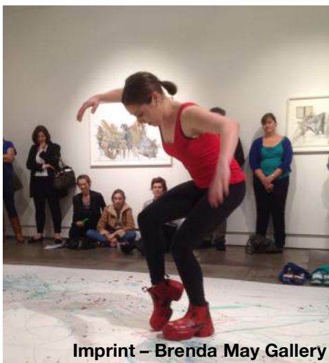
Imprint – Brenda May Gallery