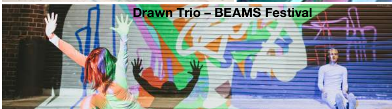
Drawn Trio – BEAMS Festival